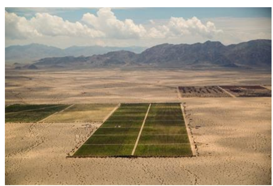
Drip-irrigated lemon orchards at the Cadiz water project in the Mojave Desert.