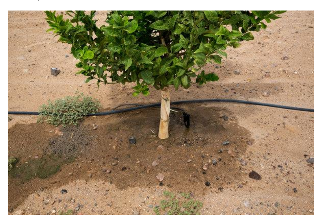
Drip-irrigated lemon trees and vineyards are so far producing the project's only revenue.

After Poseidon's new plant begins producing desalinated water late this year, the monthly water bill for a typical consumer in the San Diego area will rise by about $5, to $80, according to the San Diego County Water Authority.